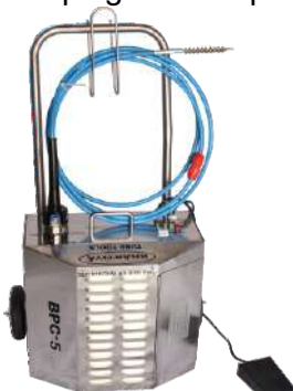
BPC-4 Tube Cleaners